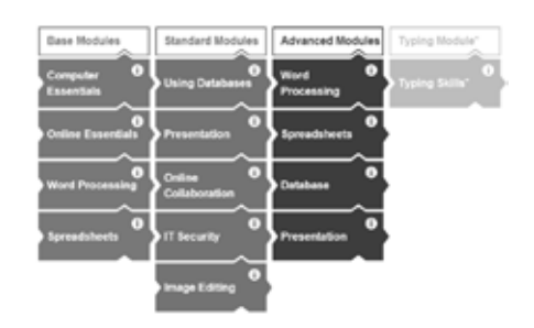
Figure 1: All ECDL modules offered in Switzerland

With the introduction of the New ECDL in Switzerland we also launched the concept of the ECDL Profile Certificate introduced by the ECDL Foundation: an ECDL certificate where the module combinations best suited to candidates can be chosen. In Switzerland only Test Centres can decide which module combination they offer in their ECDL Profile Certificate. ECDL Test Centres can put together a Profile