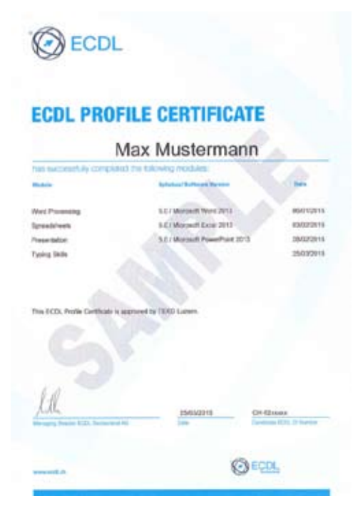
Figure 3: ECDL Profile Certificate with the endorsed Typing Skills Module